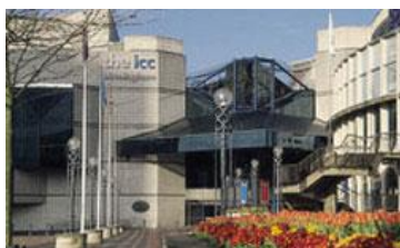
November Briefing was held at the ICC in Birmingham